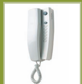
Internal handset for an Intercom system