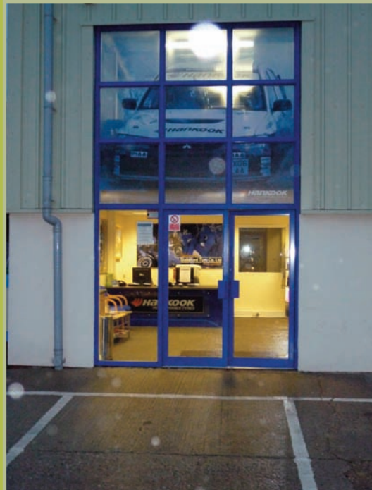
Glass door and shop front