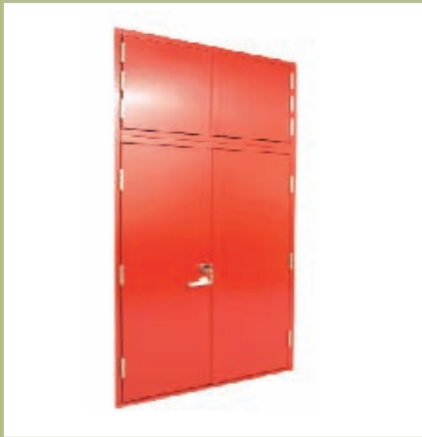
HS Raidor type Sub station doors with removable transom, openable overpanel and fire rated