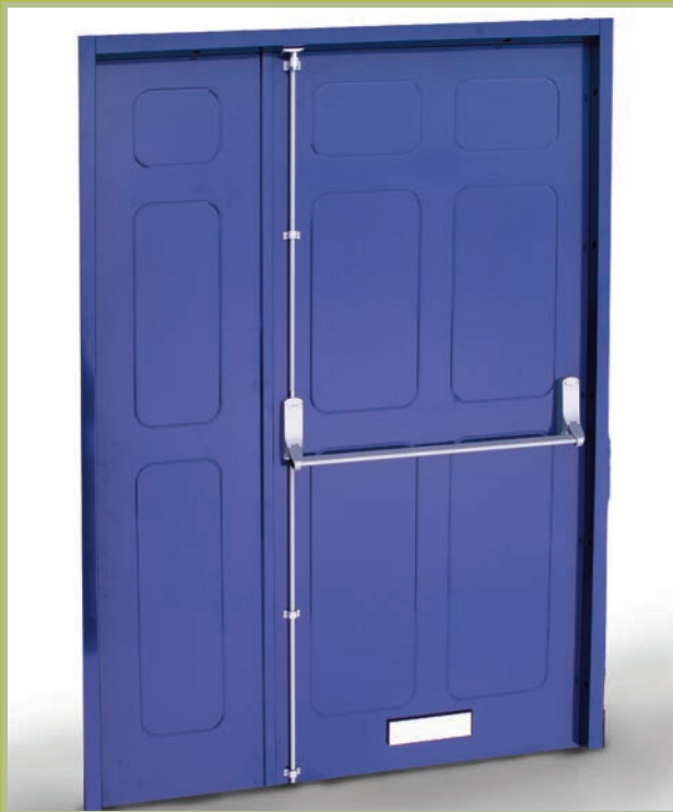
HS Decor Steel decorative panel door set with panic bar for exit, incorporating a letterbox