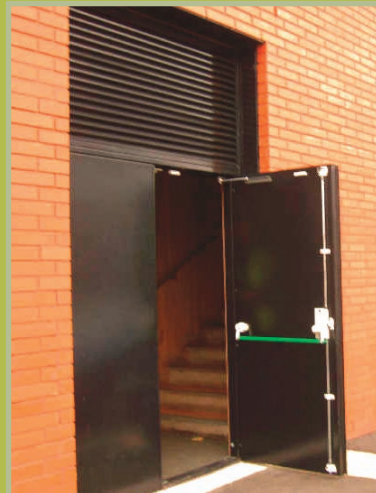
Fire escape door HS Raidor type with louvre panels above