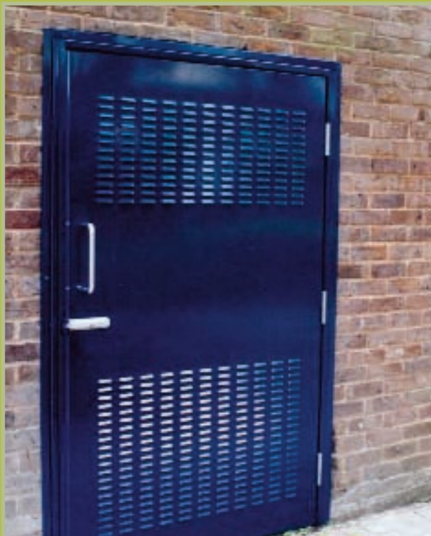
HS Raidor type Sub station doors, vented option