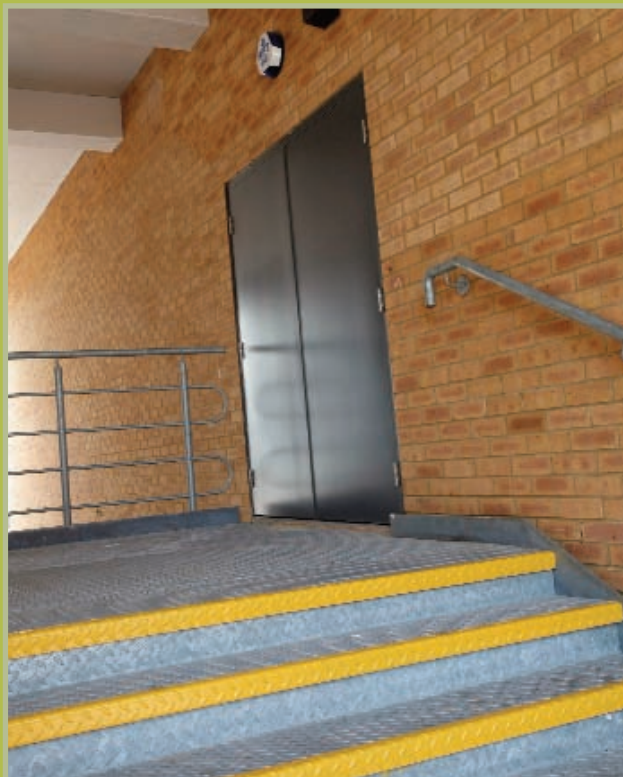
High security fire escape doorset, HS Raidor type, fire rated to 6.5 hours