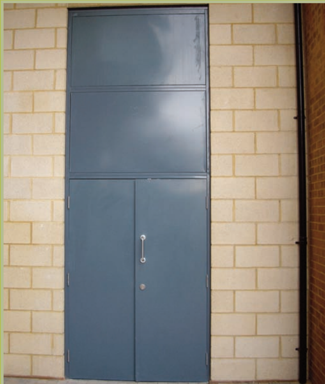
HS Raidor, Solid Steel Doors with Double over panel, fire rated