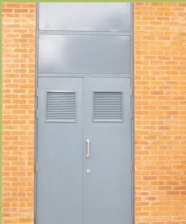
HS Raidor Steel doorset with small louvre panels inserted