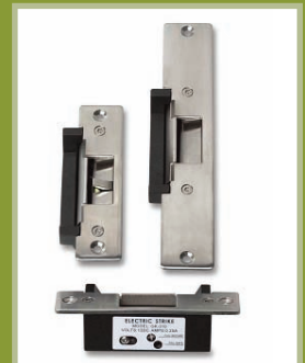
Electric strike lock