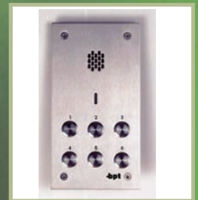
Intercom panel with keypad