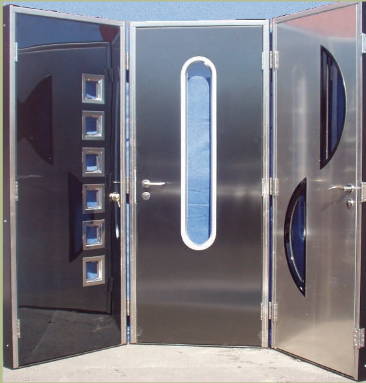
Stainless steel doors with vision panel options