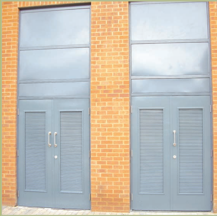
HS Raidor Steel Doors to Plant Rooms, Incorporating louvre panels