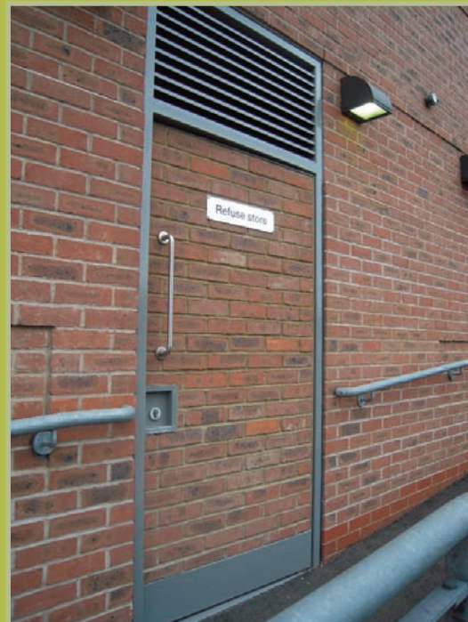
Bespoke steel door set with louvre panel and brick slips inserted