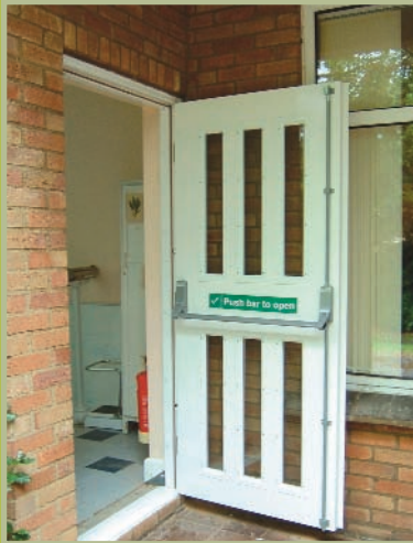
Doors made to measure for domestic installation, HS Raidor, Glazed