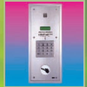
Digital Intercom panel