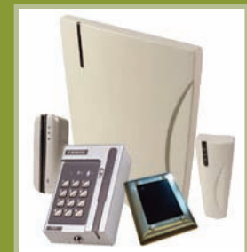
Readers and automation accessories