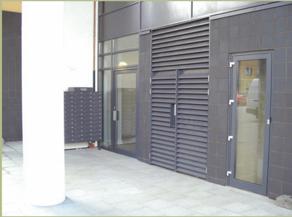
Fully louvered doors and fully glazed HS Raidor doorsets